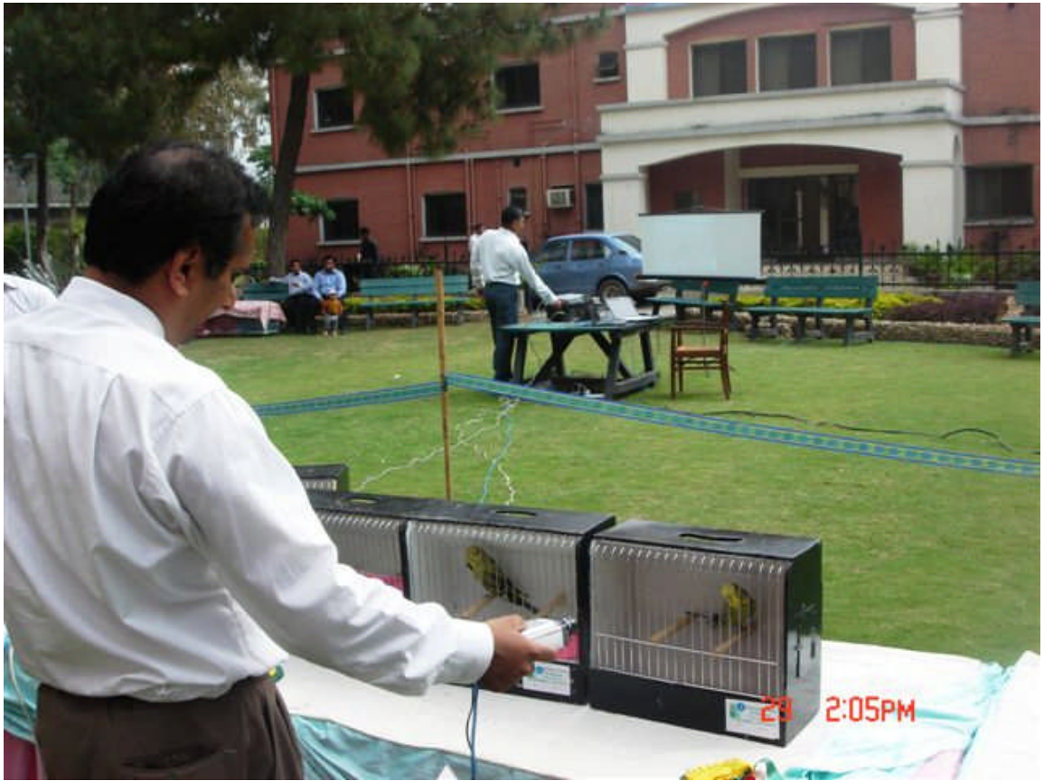
Camera at cage