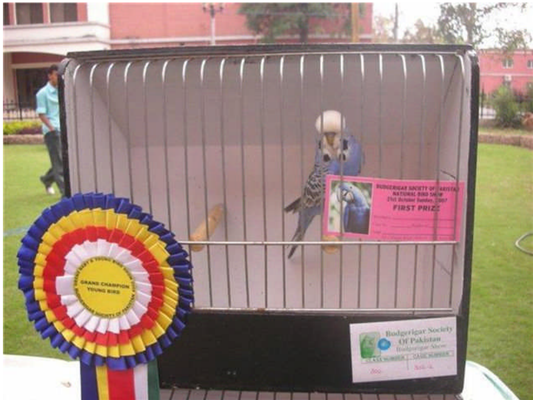
Best Young Bird BSP