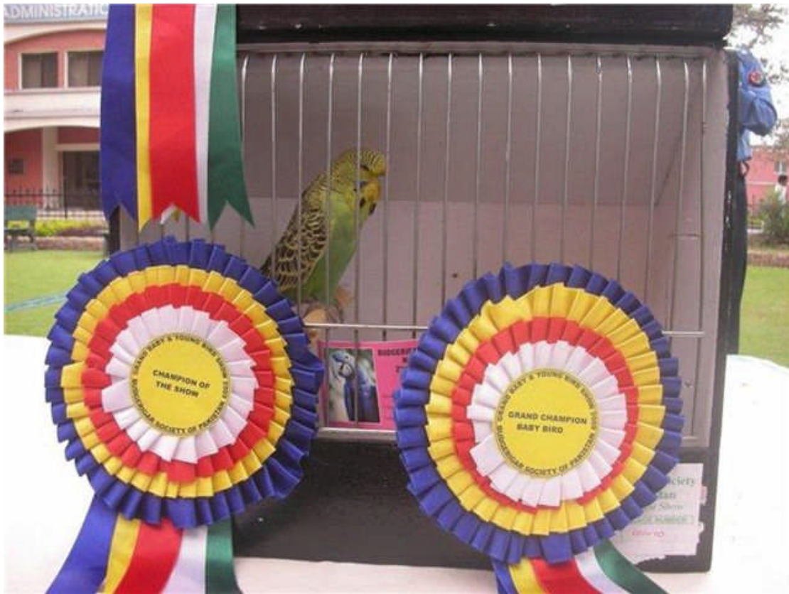
Best UBC (c)