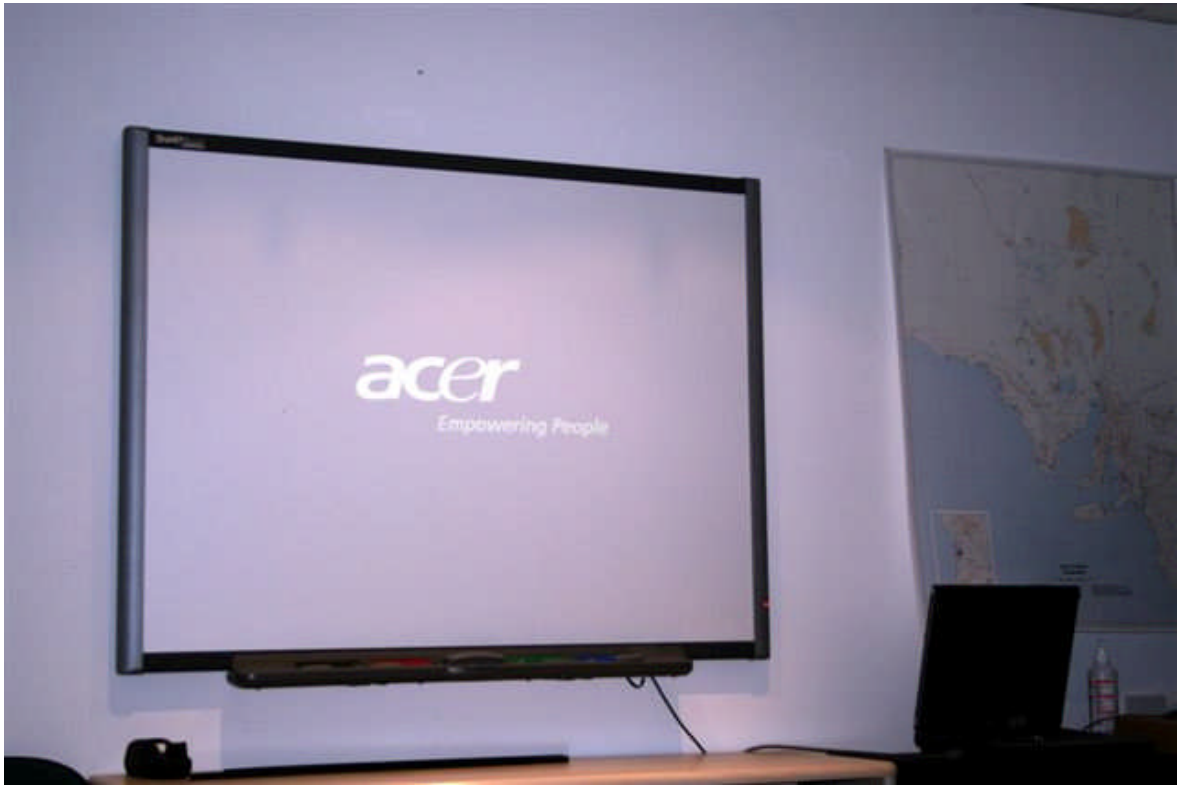
Screen in Oz