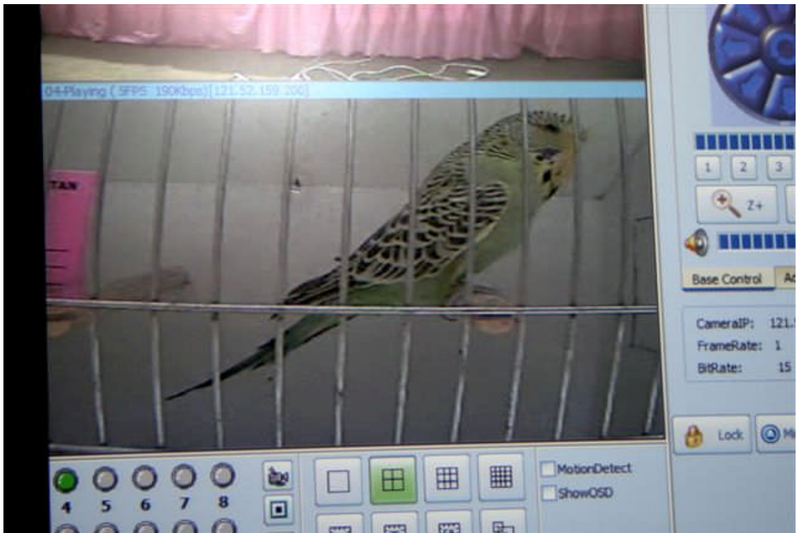
Best UBC (a)