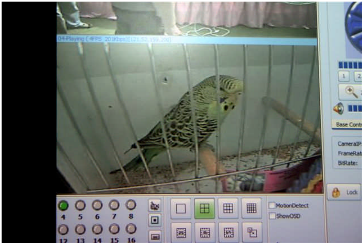
Best UBC (b)